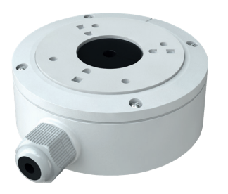
PR-JB12IP66 Small Water-proof Junction Box